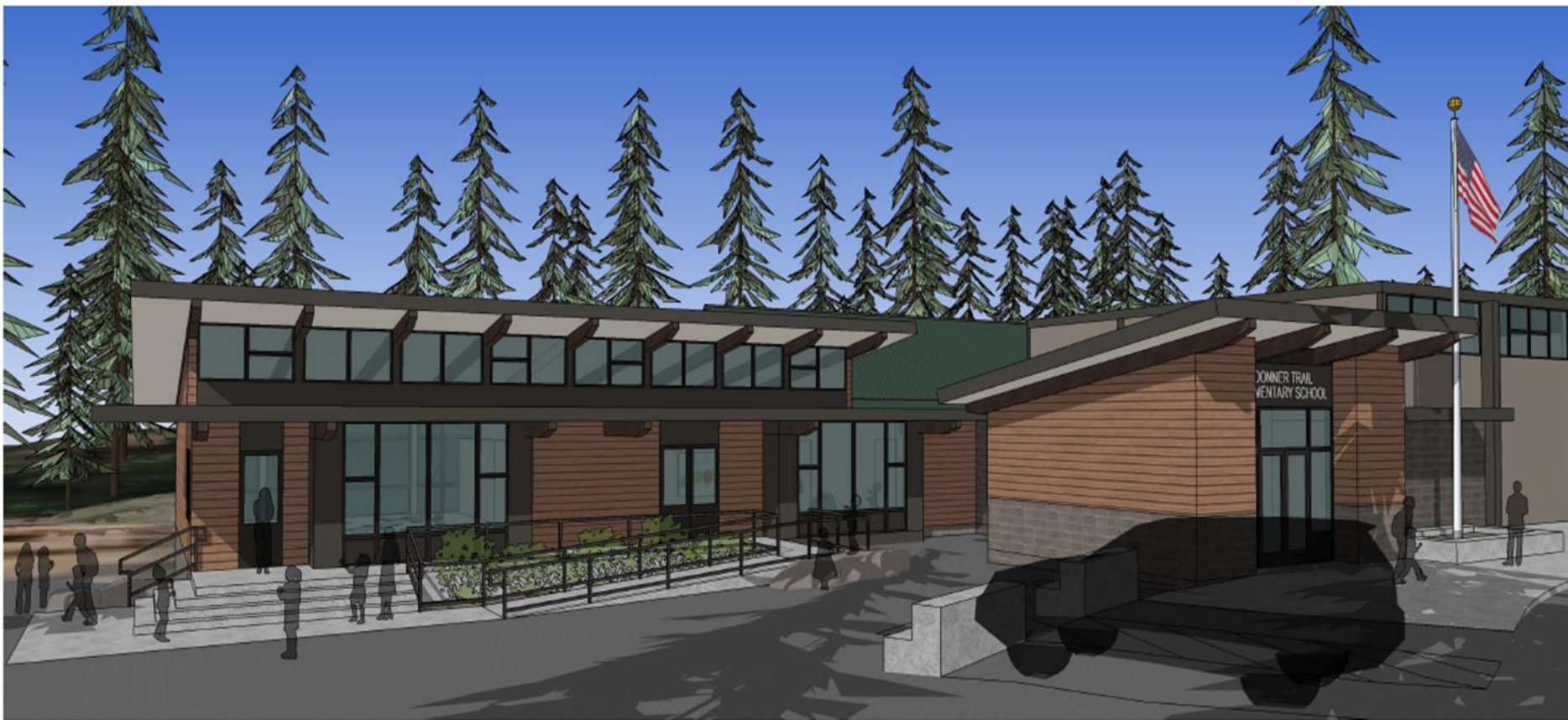
SOUTH PERSPECTIVE: SHED ENTRY OPTION