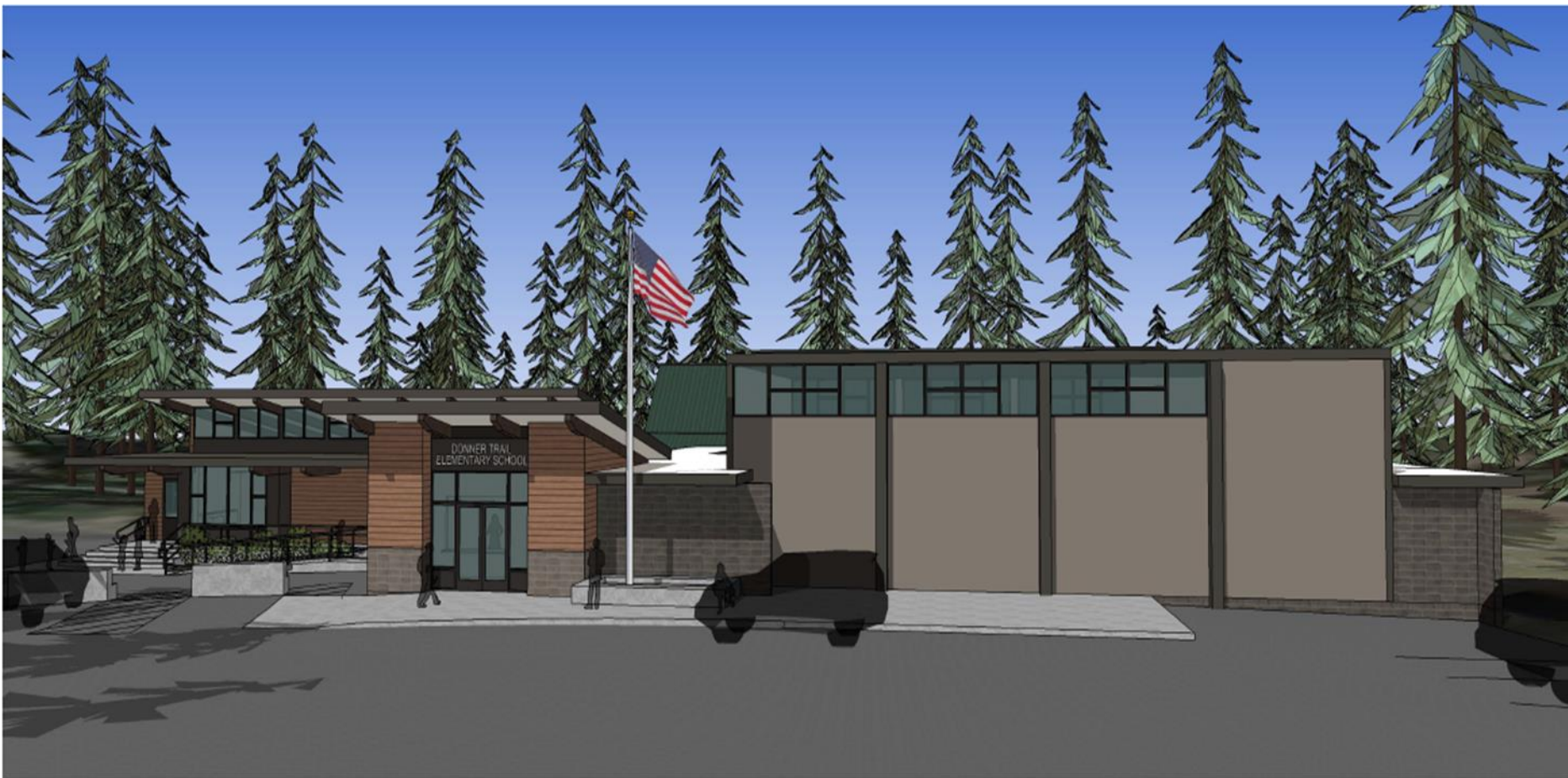
SOUTH PERSPECTIVE: SHED ENTRY OPTION