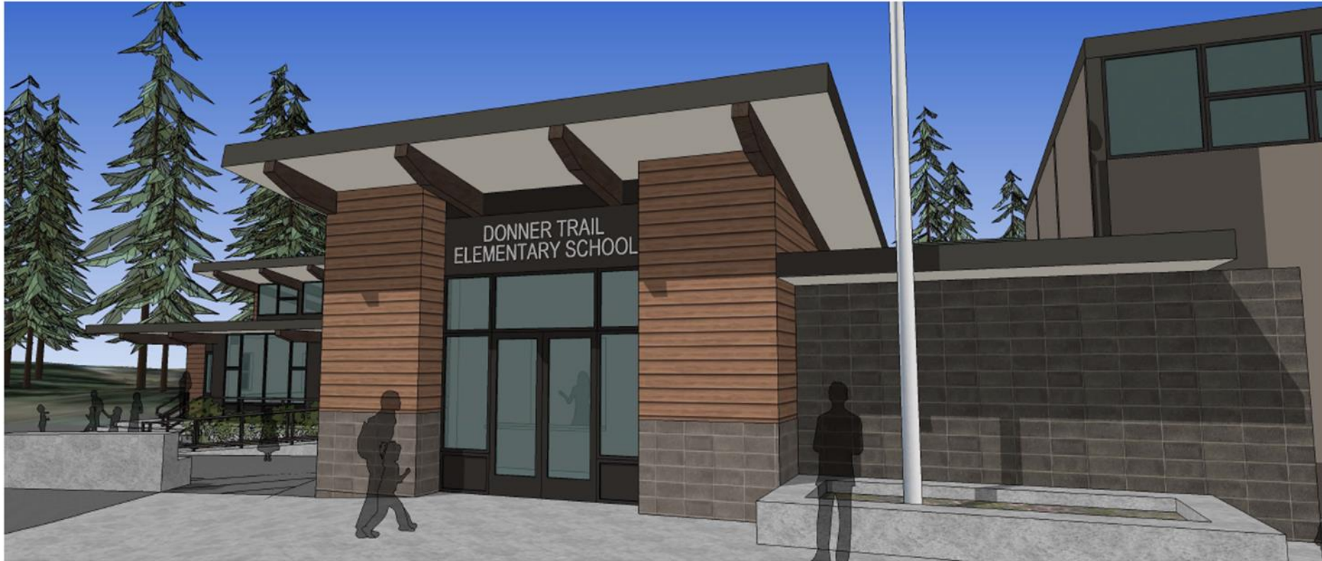
SOUTH PERSPECTIVE: SHED ENTRY OPTION